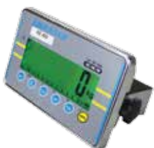
AE 402 Indicator