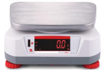
Rear Display with Integrated Touchless Sensor